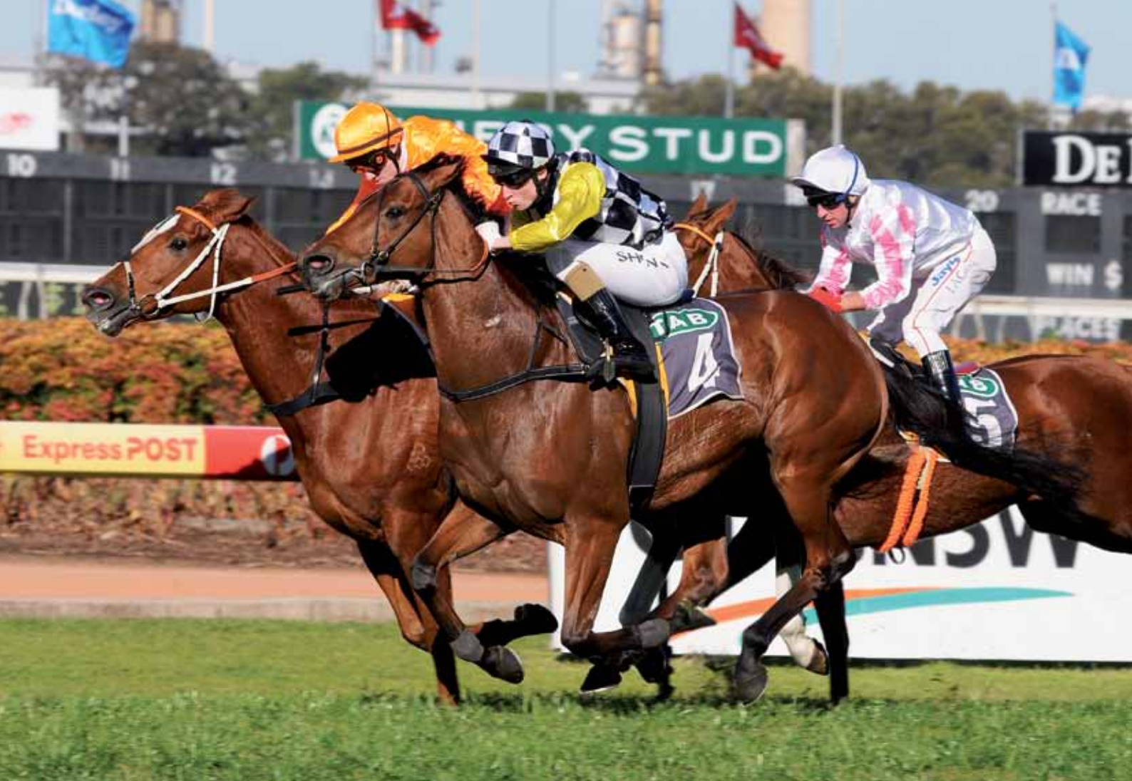
ABOVE: NSWROA members dead-heat in the Group 2-Premiere Stakes with Mentality (orange) and Kroner (black & white checked cap) hitting the line locked together

NSW also has a perfect record at Group 2 level to date having scored at all four races held. Those winners were Predatory Pricer (MRC J J Liston Stakes), Mentality (D/H STC Premiere Stakes), Kroner (NZ) (D/H STC Premiere Stakes) and Trusting (AJC Warwick Stakes).